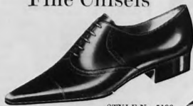
STYLE No. 5190