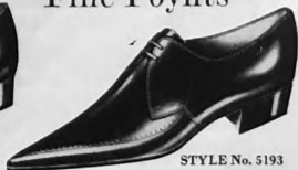
STYLE No. 5193