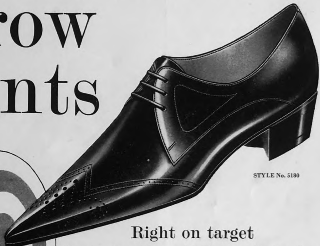
STYLE No. 5180

Right on target for style...for comfort...for value